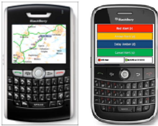
Figure 3. A BlackBerry 8800 displaying a typical location map (left), and an example of the Alert Client: ‘Red Alert, Amber Alert, Delay Amber, Cancel Alert’ (right).