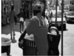
Street cleansing in Times Square, New York

"The BRC recognises that, if properly implemented, Business Improvement Districts could provide retailers with an important tool to co-ordinate collective investment to improve their trading environment. BID services however must be genuinely additional to statutory and accustomed local authority provision and deliver tangible benefits to the retail community."