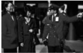
'Meeting and Greeting' in New York