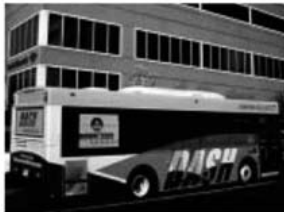
Transport success in Baltimore

Additionally, tireless effort and advocacy by the Partnership has resulted in an extra 3,300 new parking spaces.