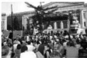
10,000 people at a BID concert in Washington

w w w . k i n g s t o n f i r s t . c o . u k