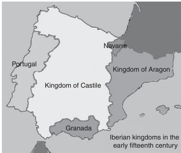
FIGURE 1. Iberian kingdoms in the early fifteenth century.

between 1119 and 1502, the vast majority of the Mudejar community remained in Tudela's Moorish quarter ( Morería de Tudela ) as an urban population but, according to primary source documents, there were also other Muslim districts in the rural areas of southern Navarre. These groups existed in the villages of Mosquera, Albea, Ablitas, Ribaforda, Pedrizas, Urzante, Cortes, Valtierra and Murillo de las Limas. There were, therefore, in addition to the urban Mudejar community in Tudela, sizeable agricultural Muslim settlements in the fertile valleys of the Merindad de la Ribera where farming was relatively prosperous.