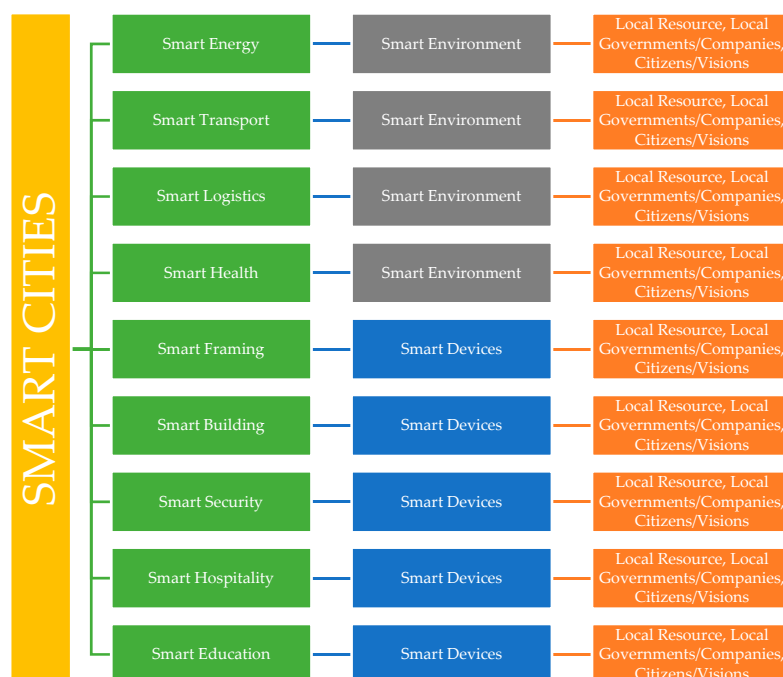
Figure 1. Shows the hierarchical structure of application areas related to smart cities [16].

Additionally, Table 1 shows the previous investigations related to EVs and GBs by different researchers. As can see the key role of renewable energy for smart city development is significant in these studies.