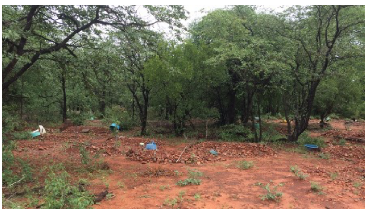
Photo 1. New burial grounds along roads to villages outside of Massingir Town.