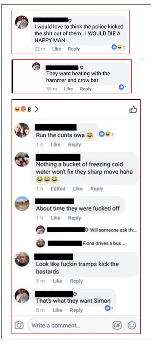
Figure 3. Facebook comments.