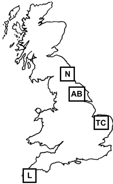
Fig. 1 Map of Great Britain showing the four regions in which ponds were sampled. N south-east Northumberland, AB Askham Bog, North Yorkshire, TC Thompson Common, Norfolk, L Lizard Peninsula, Devon

are dominated by agricultural land use, land classified as Grade 2–4 agricultural comprising 64–84% of their areas. Each of the four fall within distinct National Character Areas, (NCAs) which are biogeographically coherent areas of landscape defined by topography, land use and habitats (Natural England n.d.). The precise NCAs are No13 South Northumberland Coastal Plain, No28 Vale of York, No85 The Brecks and No157 The Lizard, the first three characterised as low-lying, whilst the Lizard's cliff top locality belies the low overall altitude. We acknowledge that the focus on lowland ponds, however diverse in their biogeography, is an important constraint on our data.