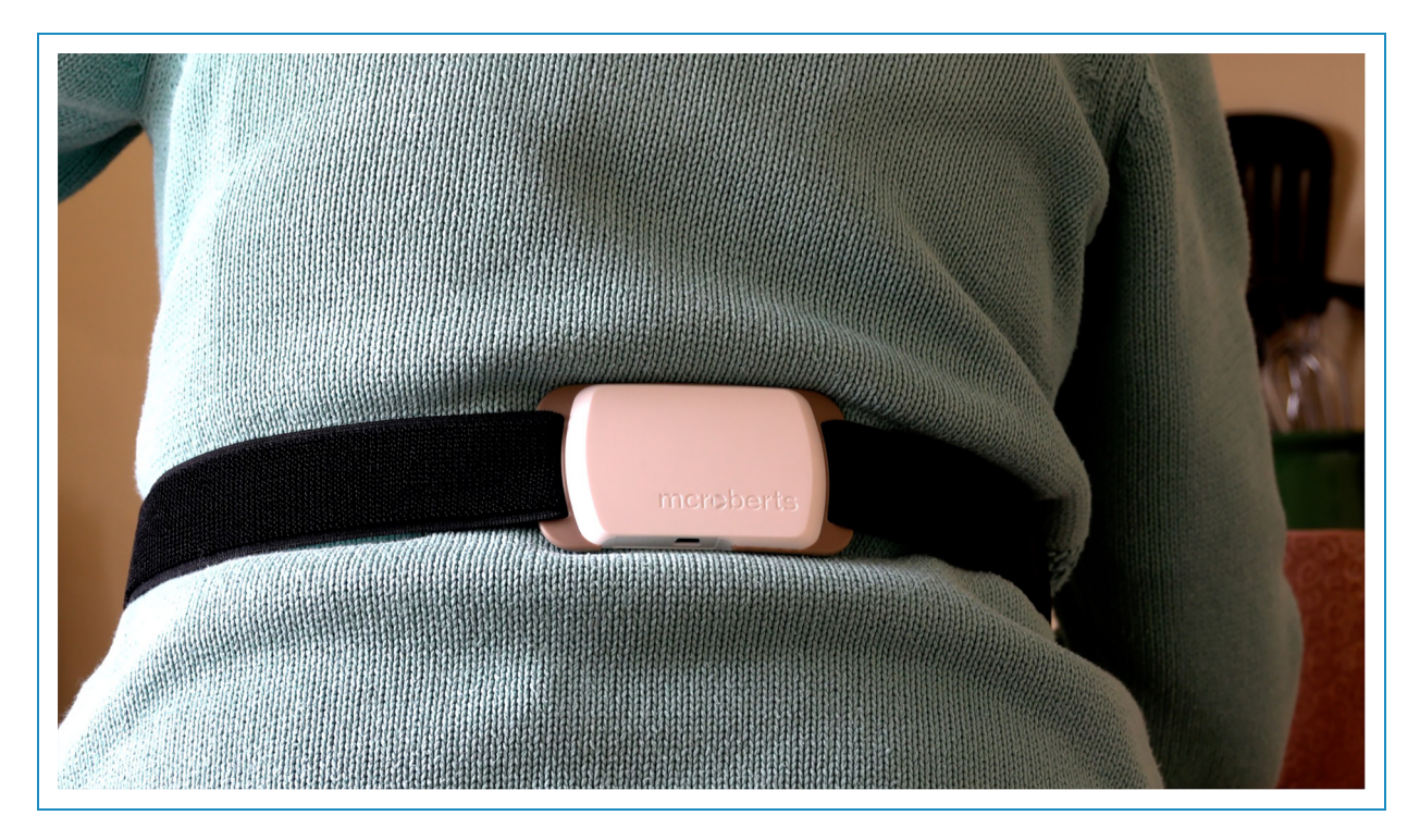
Figure 2. The McRoberts Dynaport MM+.

professionally verbatim before being translated, using professional services, into English, if required.