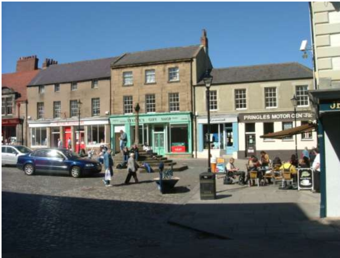
Figure 2: Alnwick Market Place

Millennium Place Durham was created with finance from the Millennium Commission and is an example of contemporary ‘design-led’ pedestrianised public spaces. The square is enclosed by a theatre, cinema and a number of chain bars and restaurants. It is minimalist, leaving one with a feeling of exposure and therefore less likely to provide opportunities for developing a strong place attachment. The street furniture is crafted to a high quality but seating is perhaps more aesthetically pleasing than user-friendly. The minimalist design is in stark contrast to the nearby historic quarter of Durham and connections to the town centre are problematic.