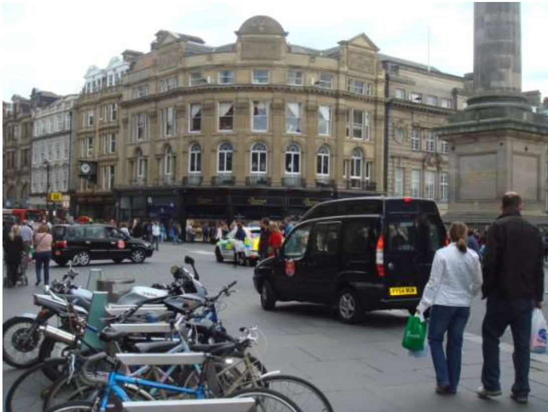
Figure 5: Old Eldon Square, Newcastle