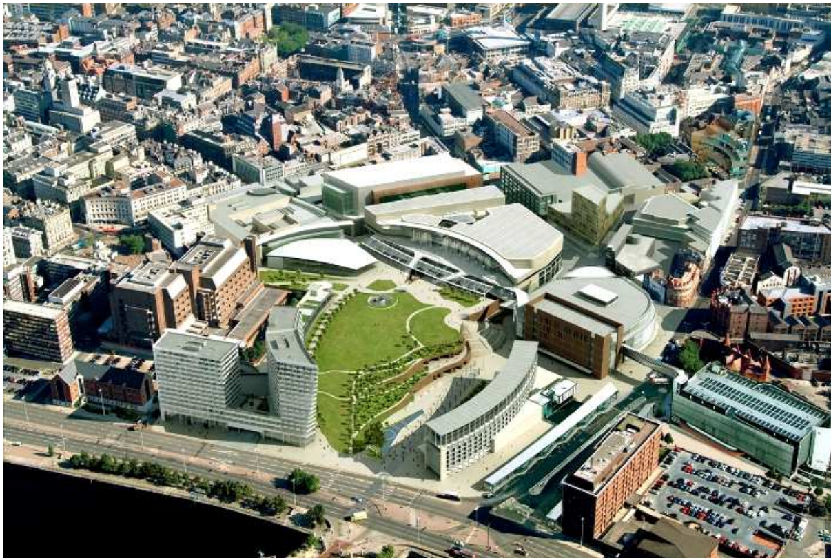
Figure 1. Liverpool’s city centre renaissance

One place-shaping scheme, privatised space and along with it eroded local distinctiveness. In doing so, some would argue that the diversity of users has been cleansed along with the buildings and urban social space (see, for example, Minton). 37 The result is a remarkable air of sameness , often curtailing some rights to the city (i.e. use) in favour of others (i.e. exchange). The streetscapes (see Figure 2), shopping malls, public art (see Figure 3), retailers, entertainment and dancing fountains, which are almost de rigueur (see Figure 4), may project cleanliness, comfort and security; providing the feeling that one is ‘close to home’ due to internationally recognised retailers, branding and symbols. More depressingly, however, many of these new and reconfigured urban spaces are designing-in homogeneity and managing-out urbanity. It is in this sense that the UK’s renaissance wave of place-shaping has saddled many towns and cities with an urban aesthetic remarkably similar to other international ‘competitors’.