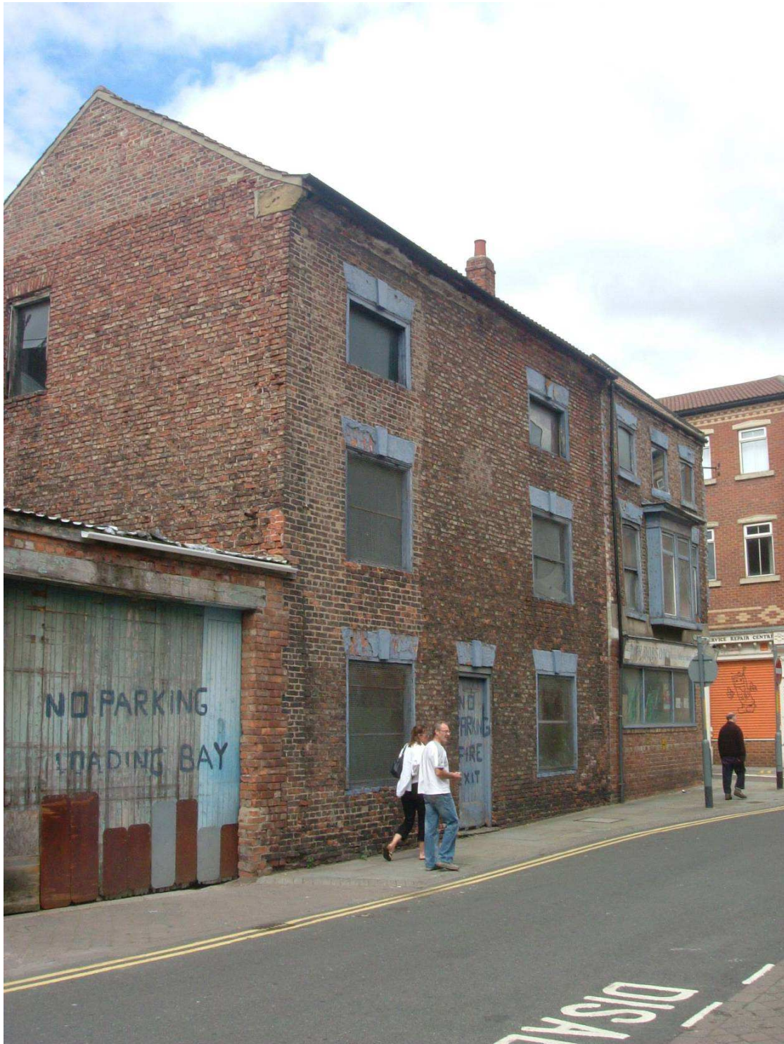
Figure 5. A 'Zombie' site in a Northern town centre

they are predominantly located in the UK's de-industrialised places. Yet, these sites pale in significance compared to the ghost towns, characteristic across some new-build residential estates in Ireland, 60 and wholesale urban abandonment across some US towns and neighbourhoods. 61