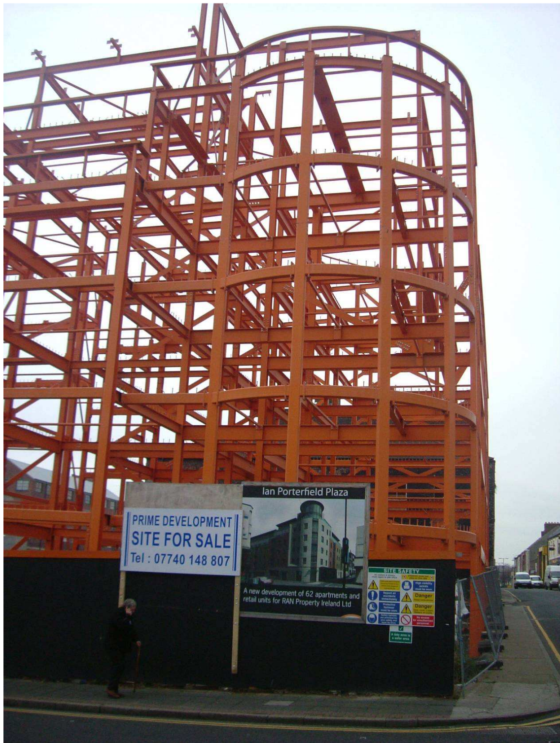
Figure 6. A mothballed housing development scheme