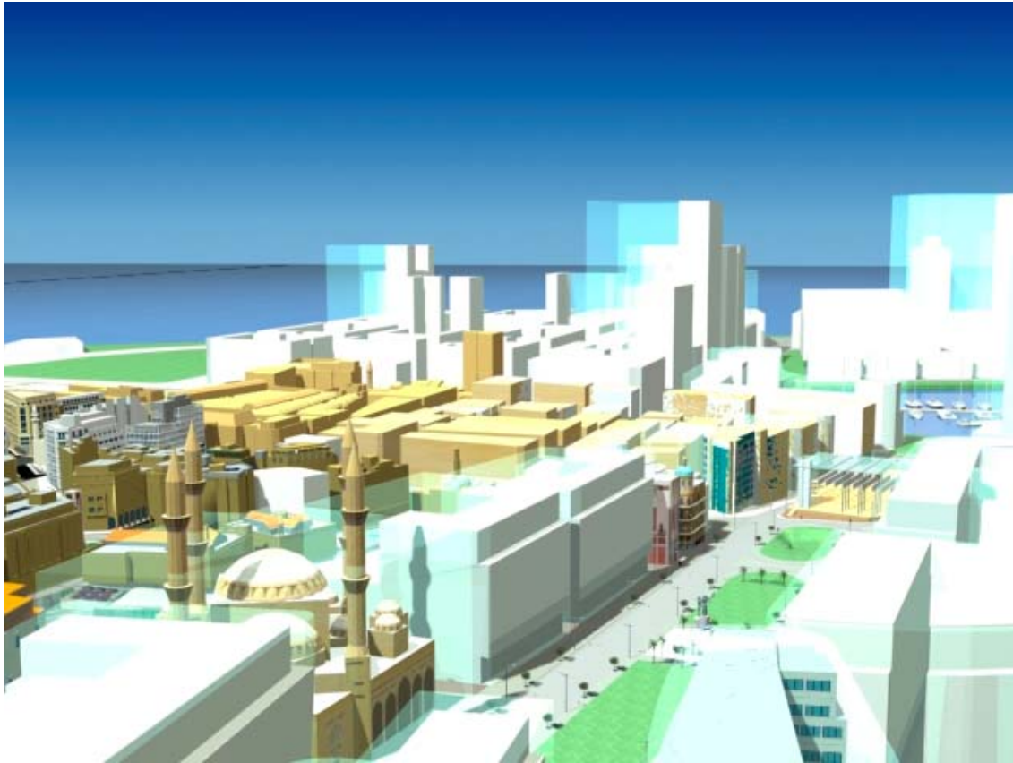
Figure 10 Aerial View over Martyr's Square

Figure 10 shows an image from the final fly-through Martyr's Square. The final animation involved the rendering of over 7000 frames in 3D Studio in TGA format which were then compiled into two AVI animations. The rendering for the animations was done across a number of PCs and took 1015 hours to complete. The final model had a file size of approximately 50 megabyte.