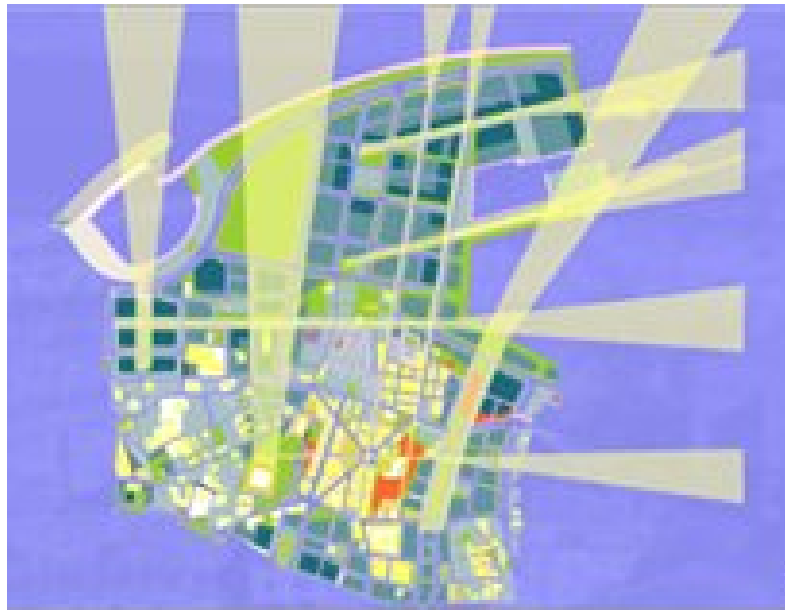
Figure 4 View Corridors in the Master Plan for Beirut

The international competition is currently inviting leading architects to submit design proposals for this historic area. Solidere felt that an animated three-dimensional model of the axis would help designers quickly gain an awareness of spatial characteristics, massing plans, design constraints and context of this significant place. A representation was required to enable specific views from points of interest and to understand how new development proposals would interact with the existing environment.