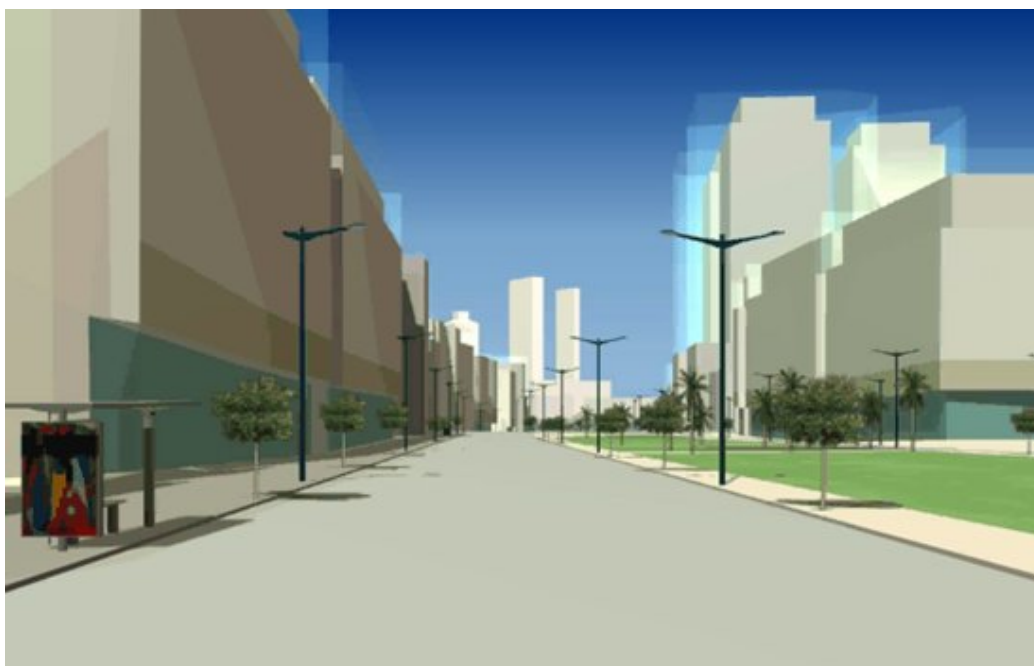
Figure 7 Simulation of Streetwall Controls and Building Envelopes

Figure 7 shows how the model evolved to incorporate streetwall controls and the outline of potential buildings within the transparent building envelopes. The building envelopes were modelled to appear transparent, yet provide a sense of scale relating to the possibility of future developments.