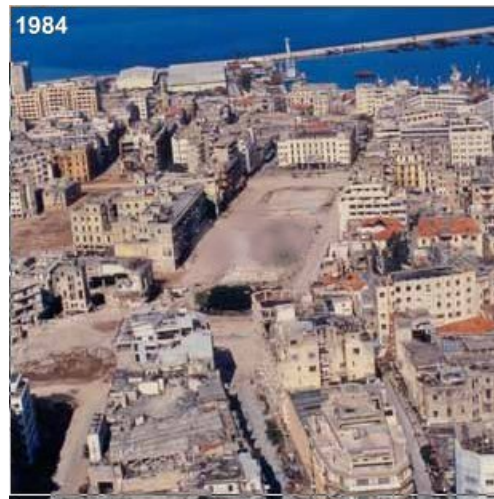
Figure 3 Martyr's Square in 1930 and 1984