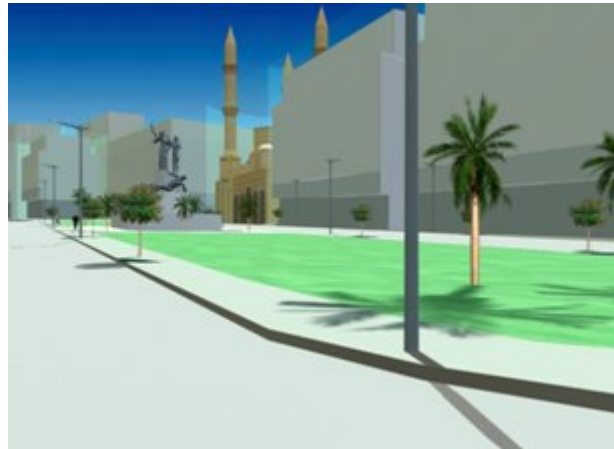
Fig. 8. Place de Martyr's – Streetscape including Statue

The model developed to incorporate the simulation of street furniture and landscaping. Even statues of important historical significance, damaged during the war but now restored, were included in the representation.