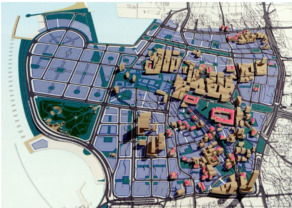
Figure 2 Initial (1996) Computer Model of Beirut Central District

However the emphasis of the Master Plan on the physical, three-dimensional aspects of development resulted in the creation, in 1996, of a computer model to assist urban designers to study layout and massing options. Solidere required this model to be used as an interactive urban design tool which could be used to consider building footprint and massing options, as well as maintaining a record of floor space and proposed land use by parcel, block and sector (Gavin 1996). The three-dimensional urban design tool was necessary to visualise the prescribed maximum building heights of proposed development in order to protect the scale of buildings adjacent to the historic centre and existing residential areas. The computer model needed to show the topography, retained buildings, roads and open spaces as well as the maximum building envelopes of new designs. In addition the model was required to visualise the streetwall controls , used to form traditional streets and provide streetscape elevation controls, and also roof planes, considered extremely important, as many roofs will be overlooked.