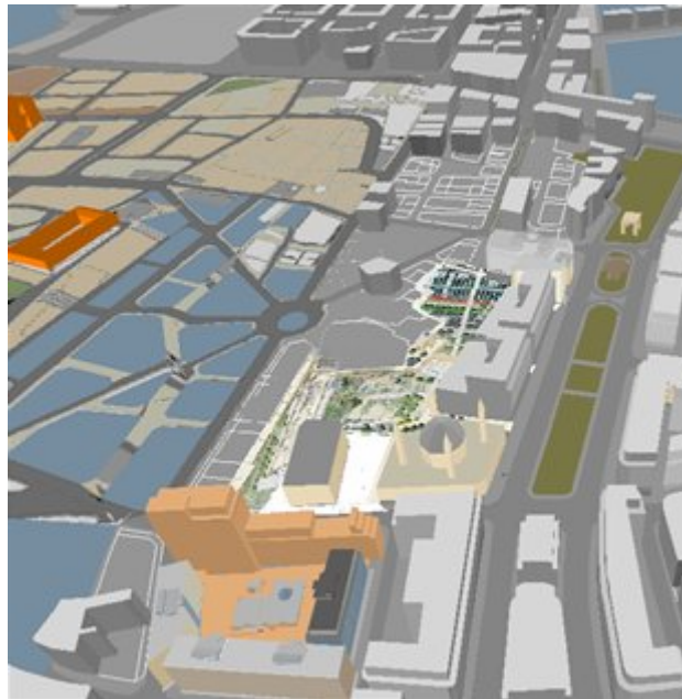
Figure 6 Interactive Model of Martyr's Square

and feedback followed in order to ensure the accuracy and appropriateness of the final end result.