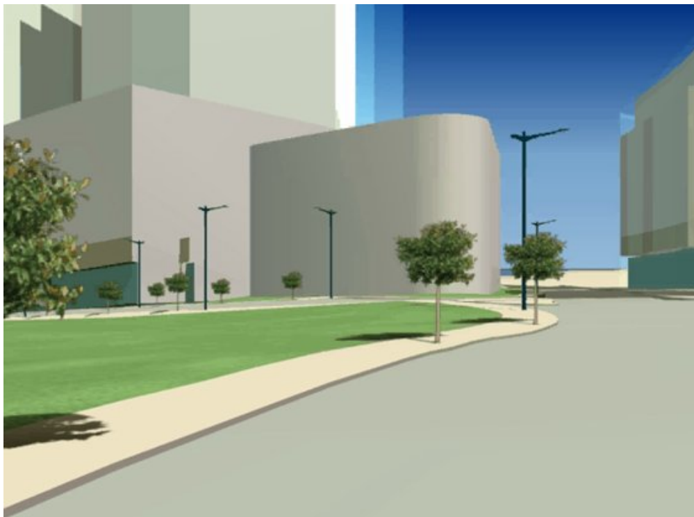
Fig.9. Intersecting View Corridors

The paths of the animation were carefully designed to emphasise the importance of the view corridors and to provide designers with the spatial characteristics of the intersections of these.