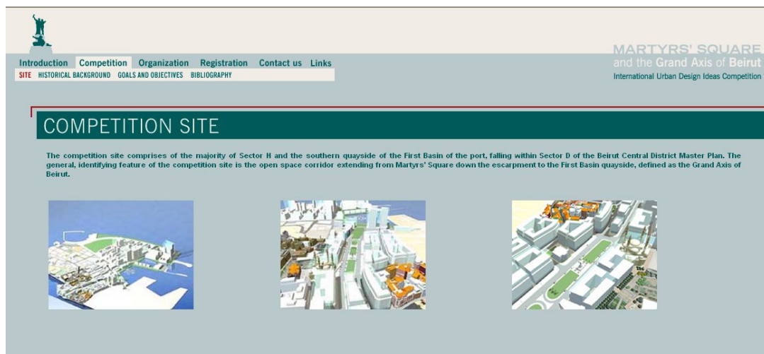
Figure 11 Aerial Views on Competition Web Site

entrants. A smaller file-size version was produced for the client's competition web site.