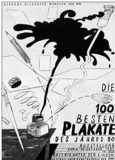
Volker Pfüller (1981)

Volker Pfüller and Helmut Brade have very expressive and calligraphic approaches to typography in their theatre and exhibition posters. Hand drawn typography and image become linked into a coherent artistic statement. Idiosyncrasy and the unique character of personal handwriting stand in opposition to the homogenous collective. Brade found that alternatives to letterpress type, like Letraset, were simply too expensive.